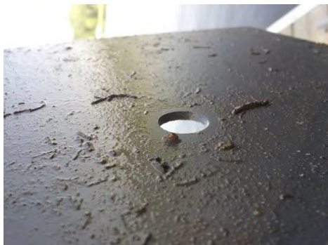
Zebra mussel on sampling plate.

Zebra mussels are an invasive (non-native) species that can compete with native species for food and habitat, cut the feet of swimmers, reduce the performance of boat motors, and cause expensive damage to water intake pipes. Less than three percent of Minnesota's 11,842 lakes are listed as infested with zebra mussels. More information on zebra mussels is available at www.mndnr.gov/AIS .