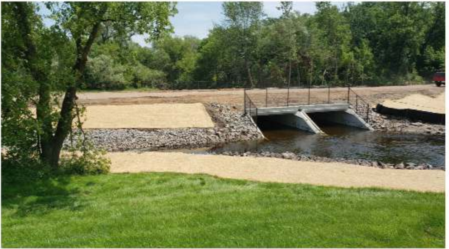
Erosion control and turf establishment on West banks