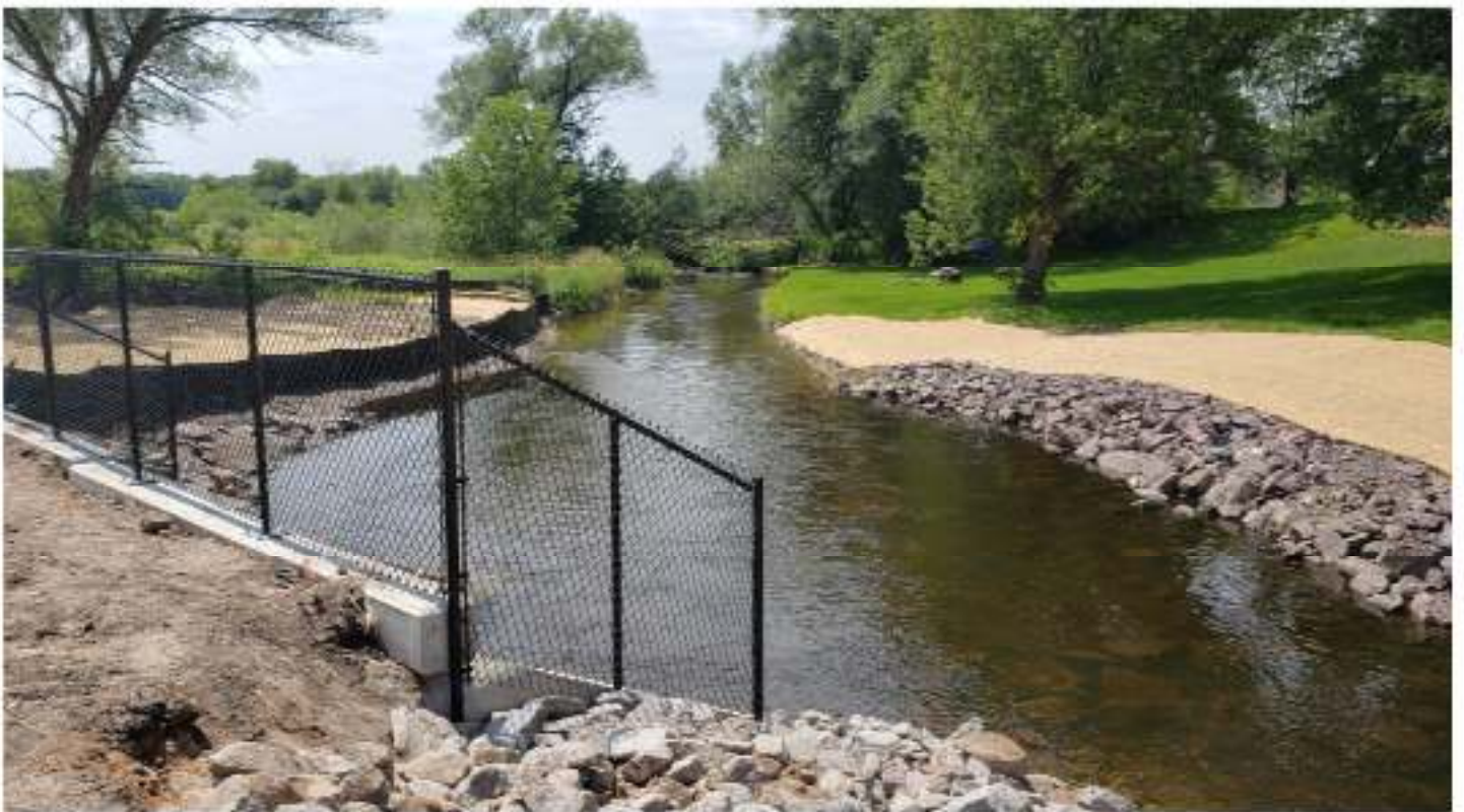
West bank safety fencing