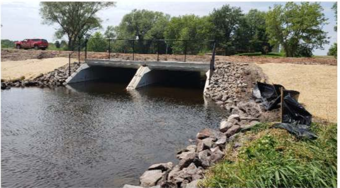
East bank safety fencing and rip rap