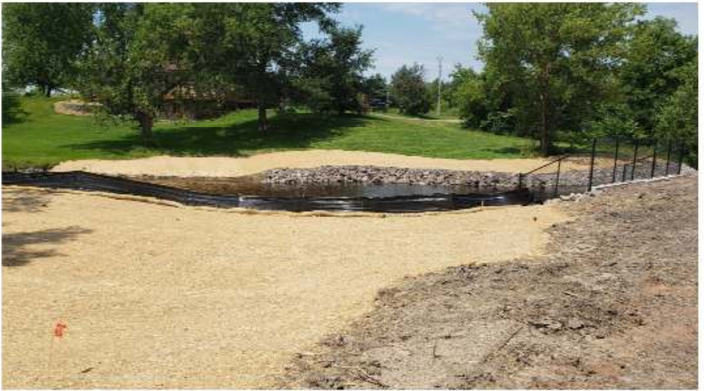
Erosion control and turf establishment