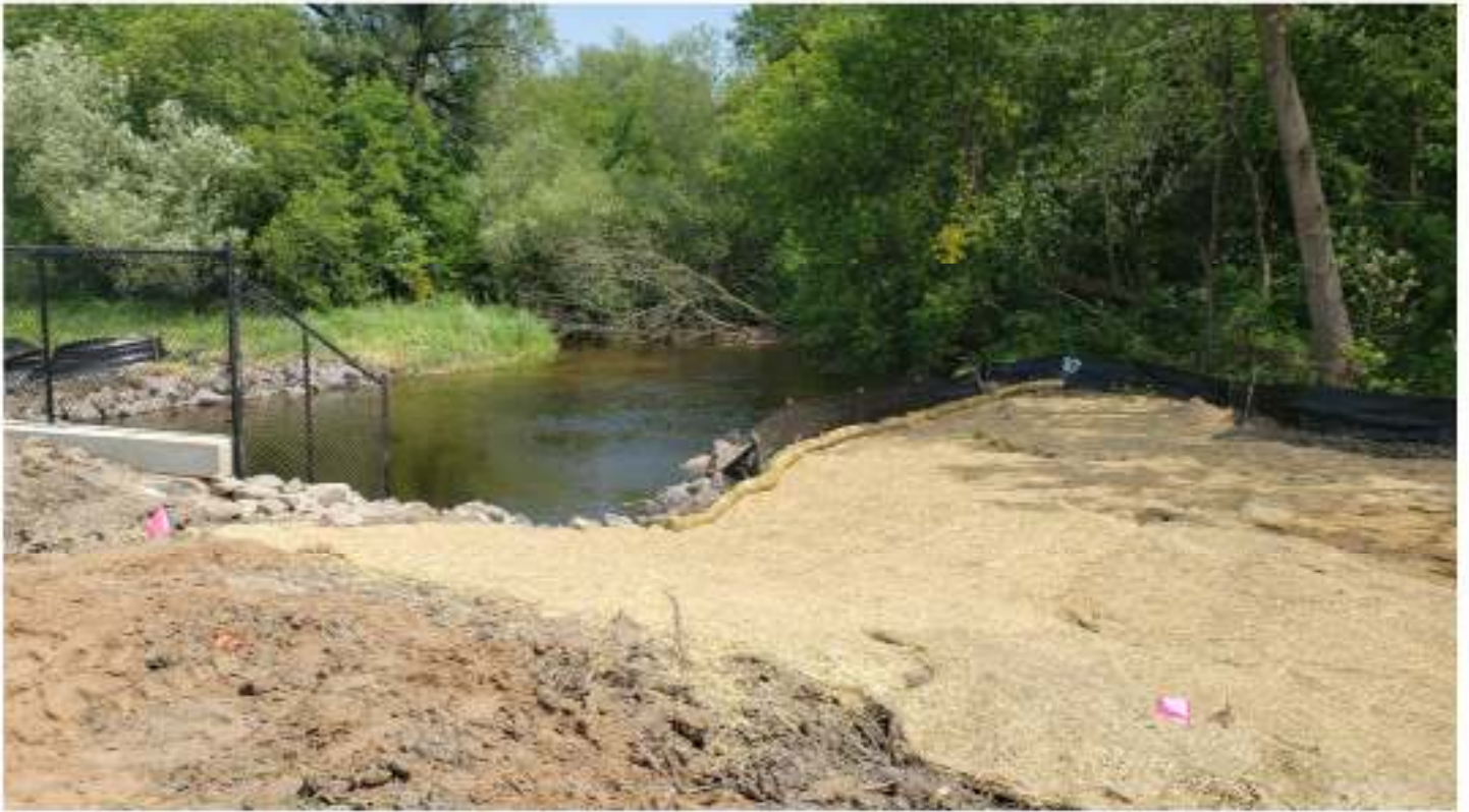
Erosion control and turf establishment