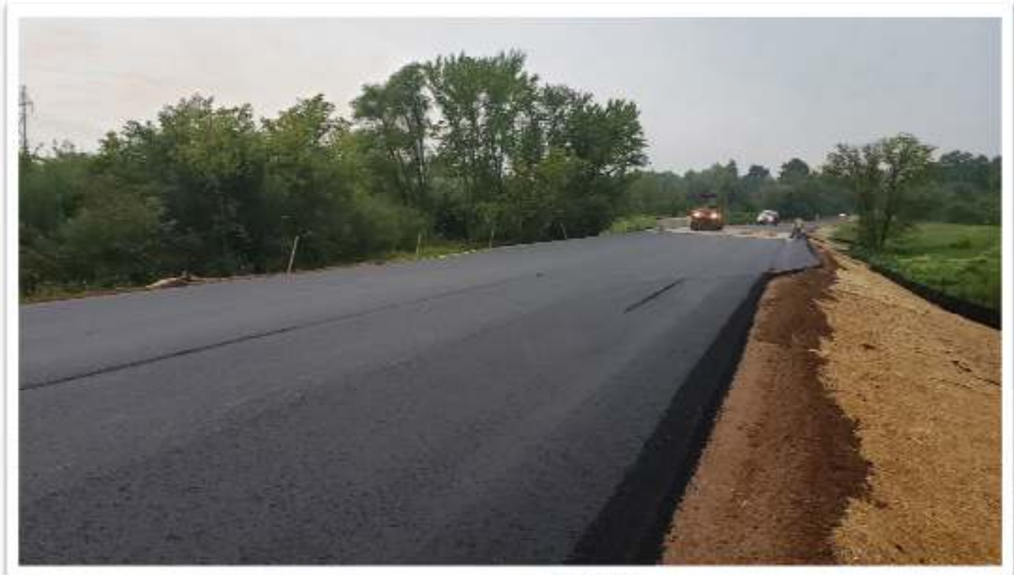
new pavement, east side of bridge.