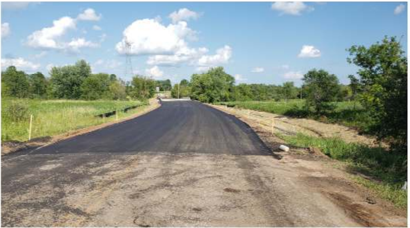
New pavement, West side of bridge.