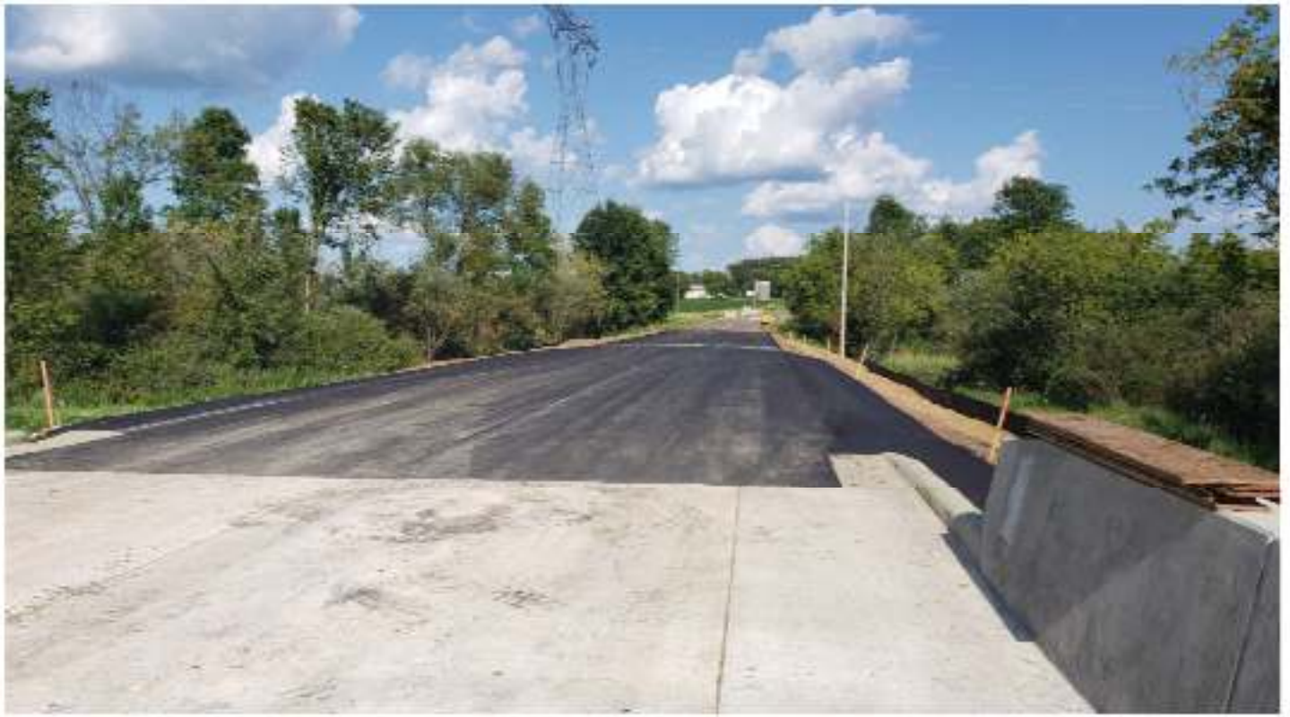
New pavement, East side of bridge.