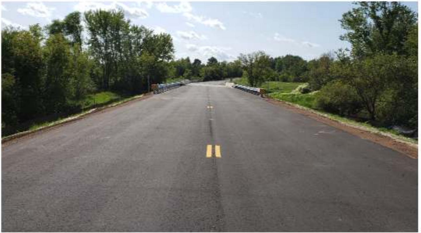
Temporary road markings