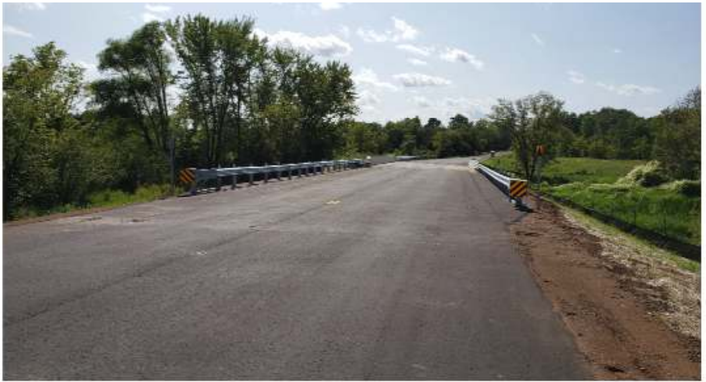
New guard railings