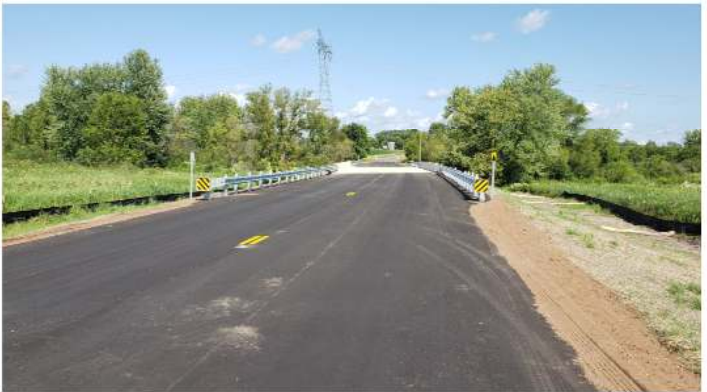
Temporary road markings