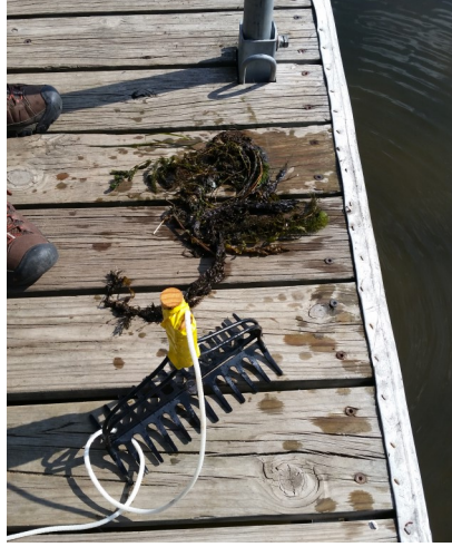
Two-Sided Rake Used to Sample for Aquatic Plants

In 2019, Chisago County launched a new program to monitor for new infestations of aquatic invasive species (AIS) located at public water accesses in the county. The goal is provide early detection and treatment if county staff discover new infestations of AIS.