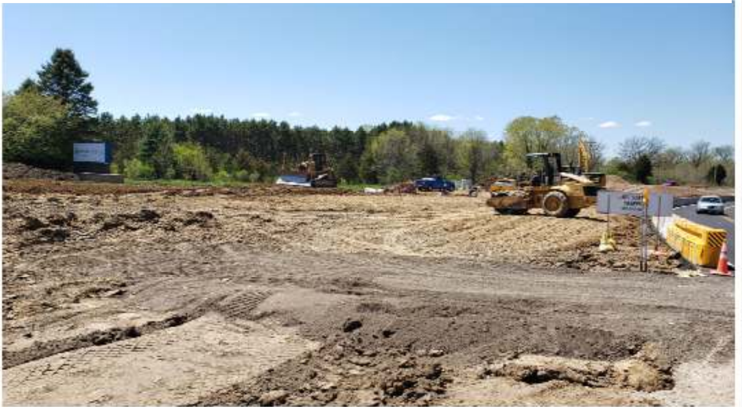
Site of New Roundabout