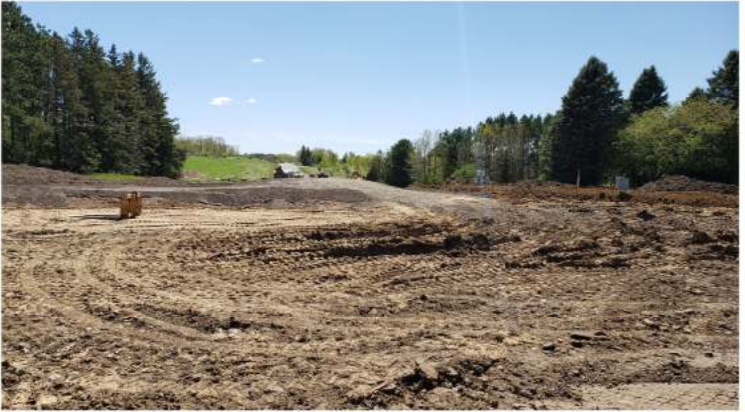
Site of New Roundabout