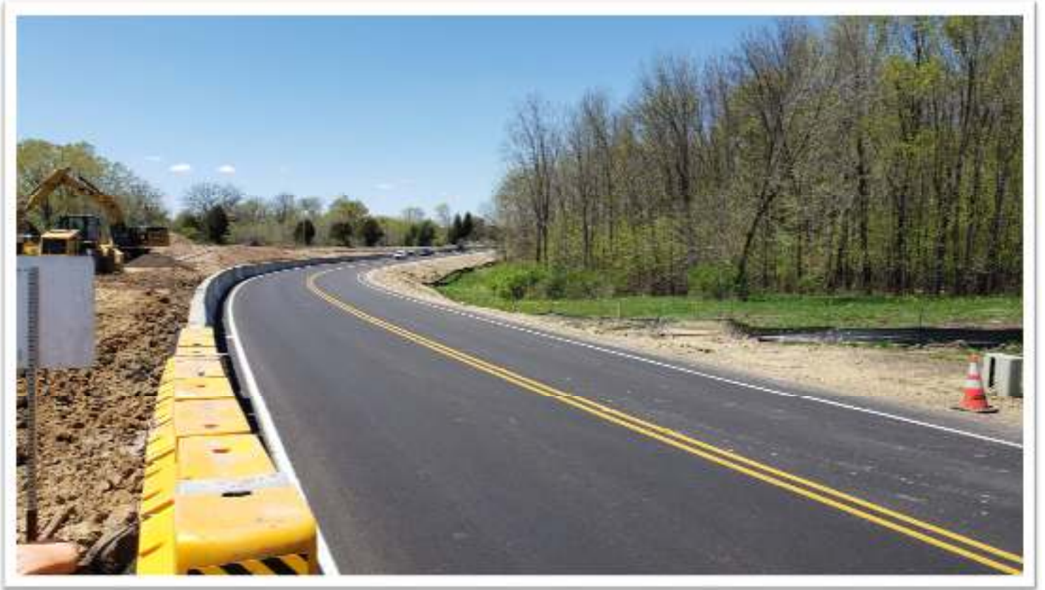
Temporary By-Pass Lane.