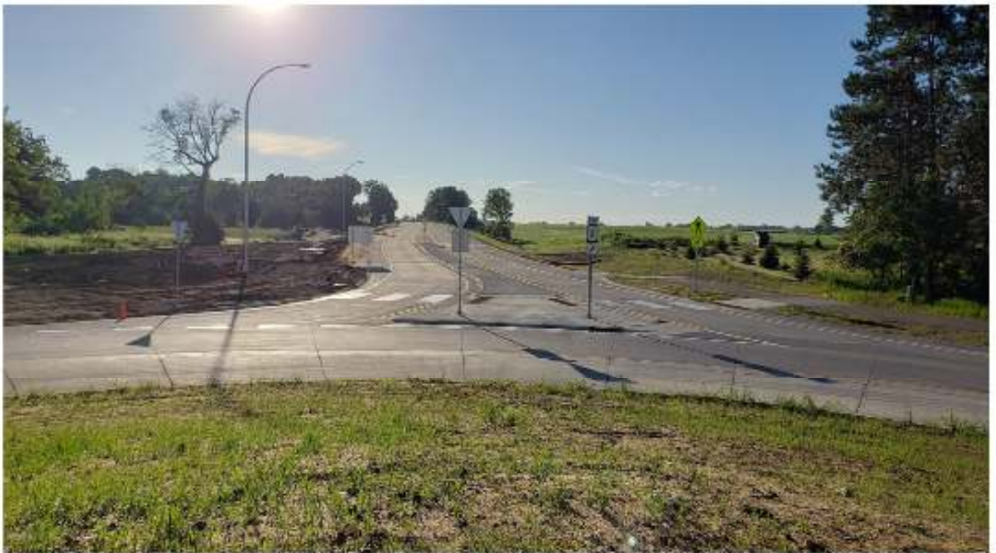
New Roundabout- Looking West