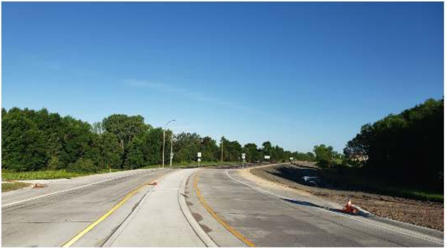
New Roundabout- Looking East